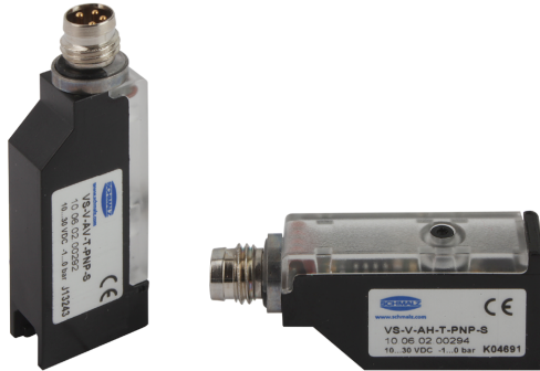
Vacuum and Pressure Switches VS-V/P-AH/AV-T